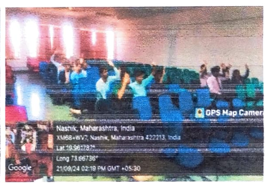
Highlighting the interactive teaching-learning process, with students actively engaging in the LinkedIn optimization session.