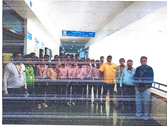
Students Engaged in Hands-On Learning and Real-World Problem Solving & Group Photo.