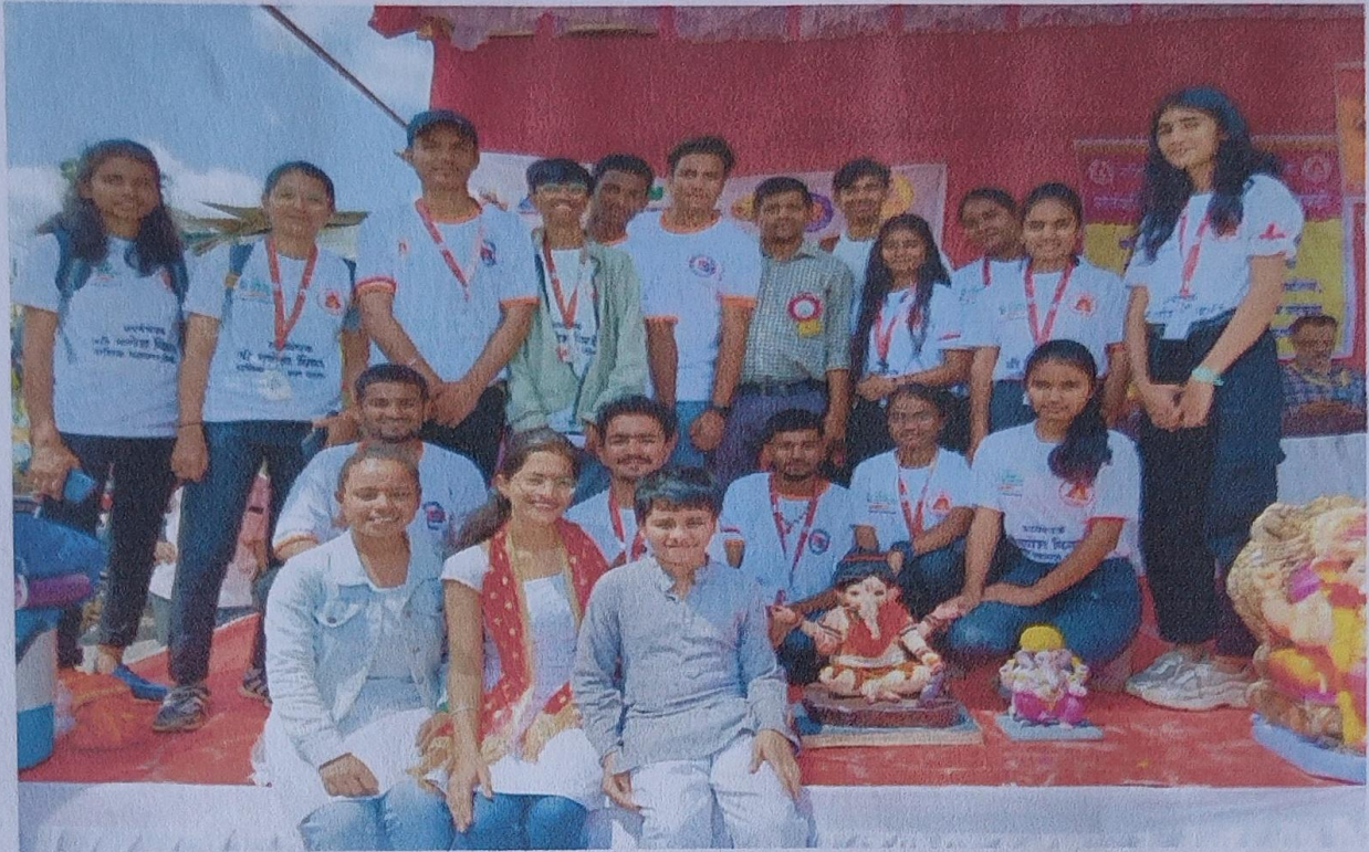
NSS volunteer Group Photo