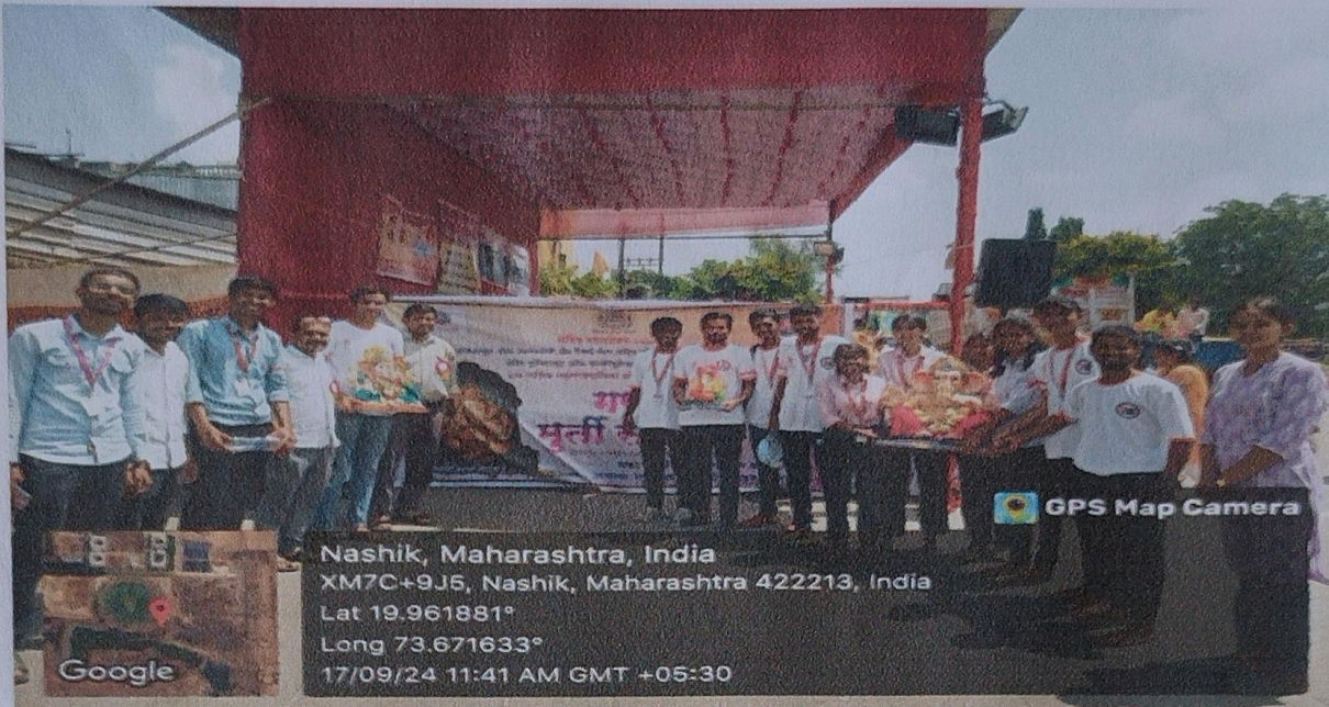
NSS program Officer with volunteers