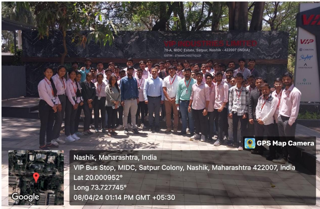
Group Photo at VIP Industries Ltd.