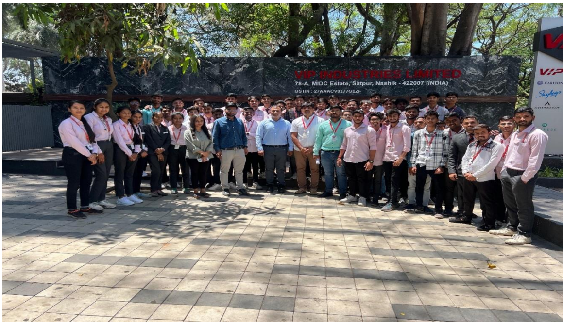
Group Photo at VIP Industries Ltd.