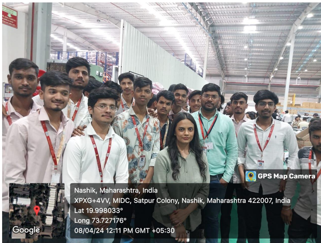
Group Photo at VIP Industries Ltd.