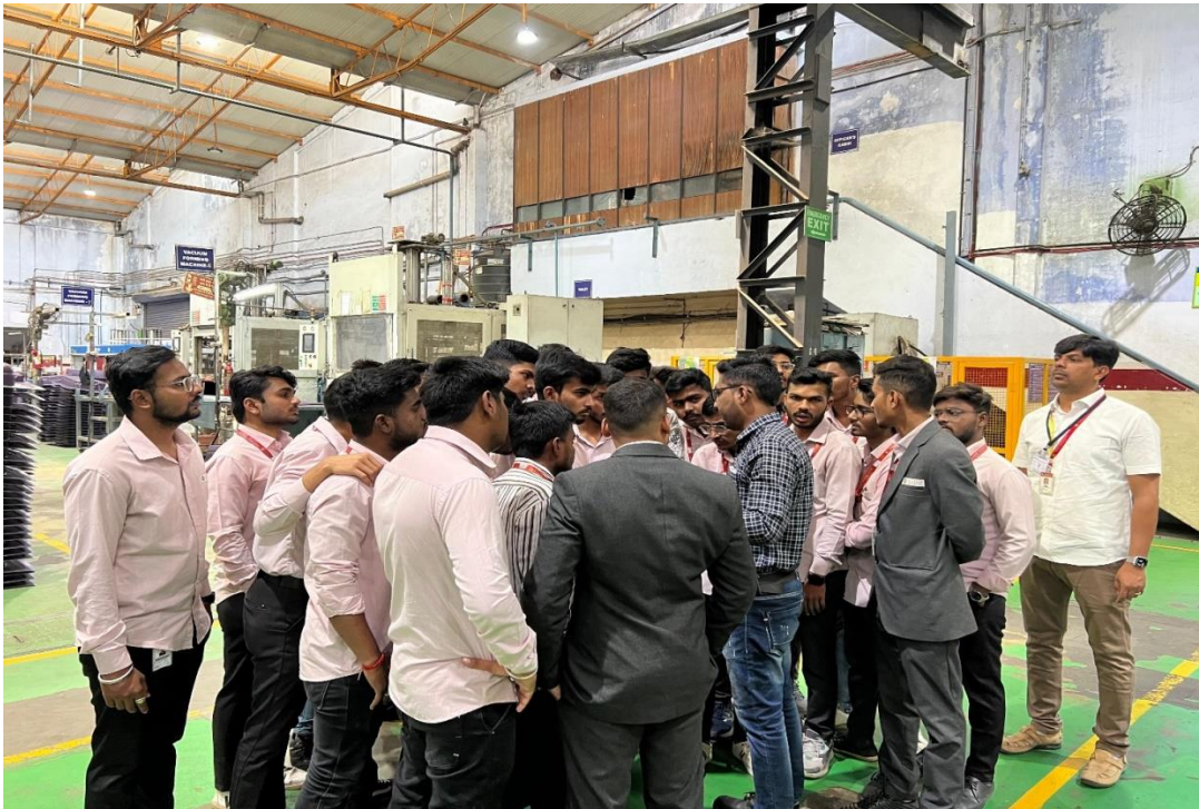
Machine shop introduction at VIP Industries Ltd.