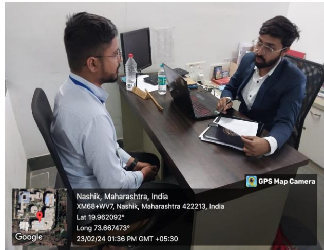
Students participating in the interview