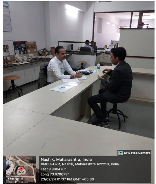
Students participating in the interview