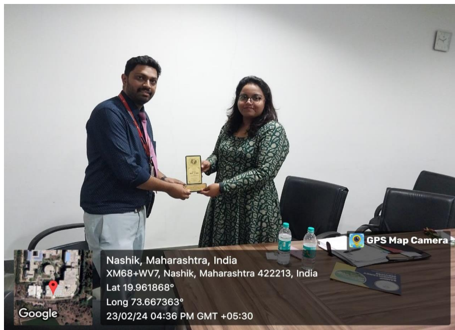
Facilitation to HR representatives from the Mechanical Department at SIEM.