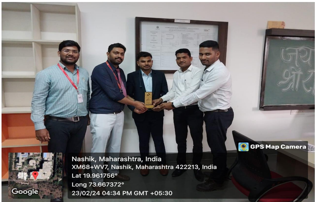
Facilitation to HR representatives from the Mechanical Department at SIEM.