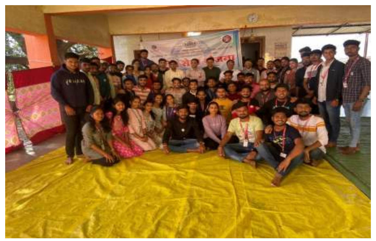
Group Photo NSS