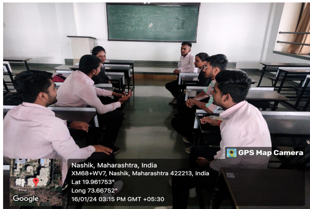
Student Group Discussion