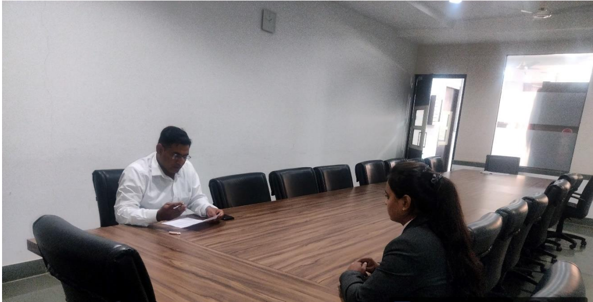
Personal Interview Session