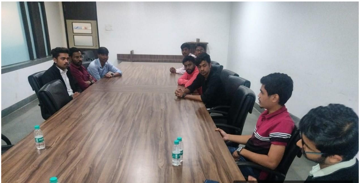
Group Discussion Session