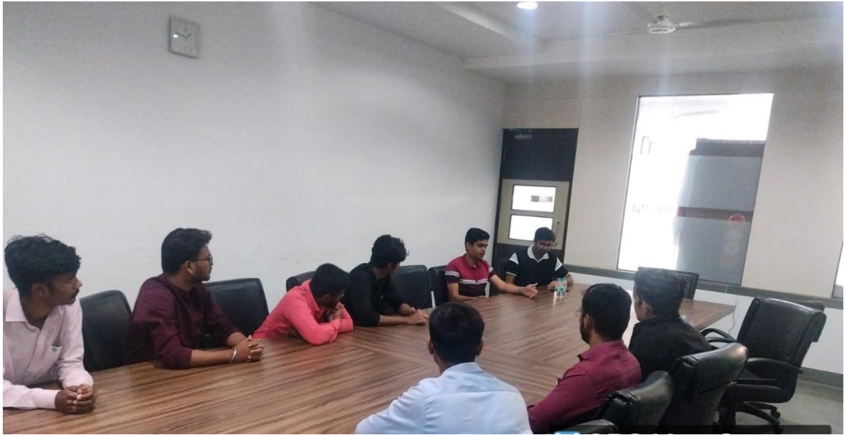
Group Discussion Session