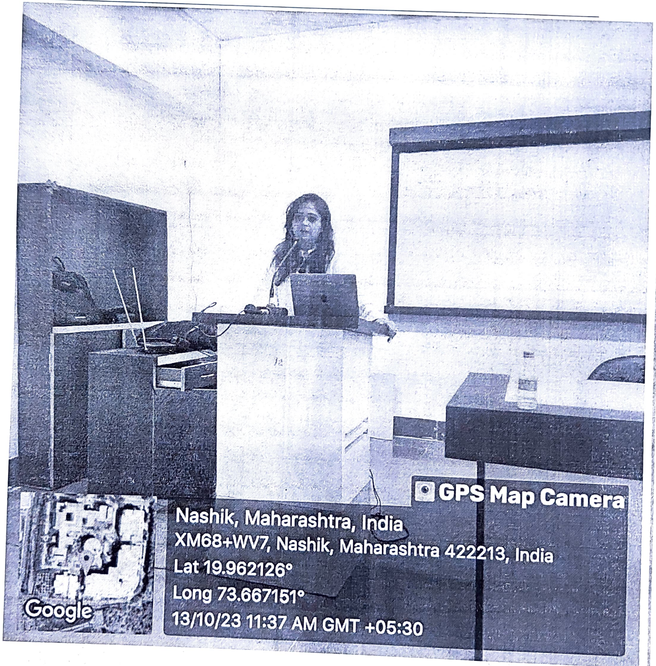
Inaction by speaker with students