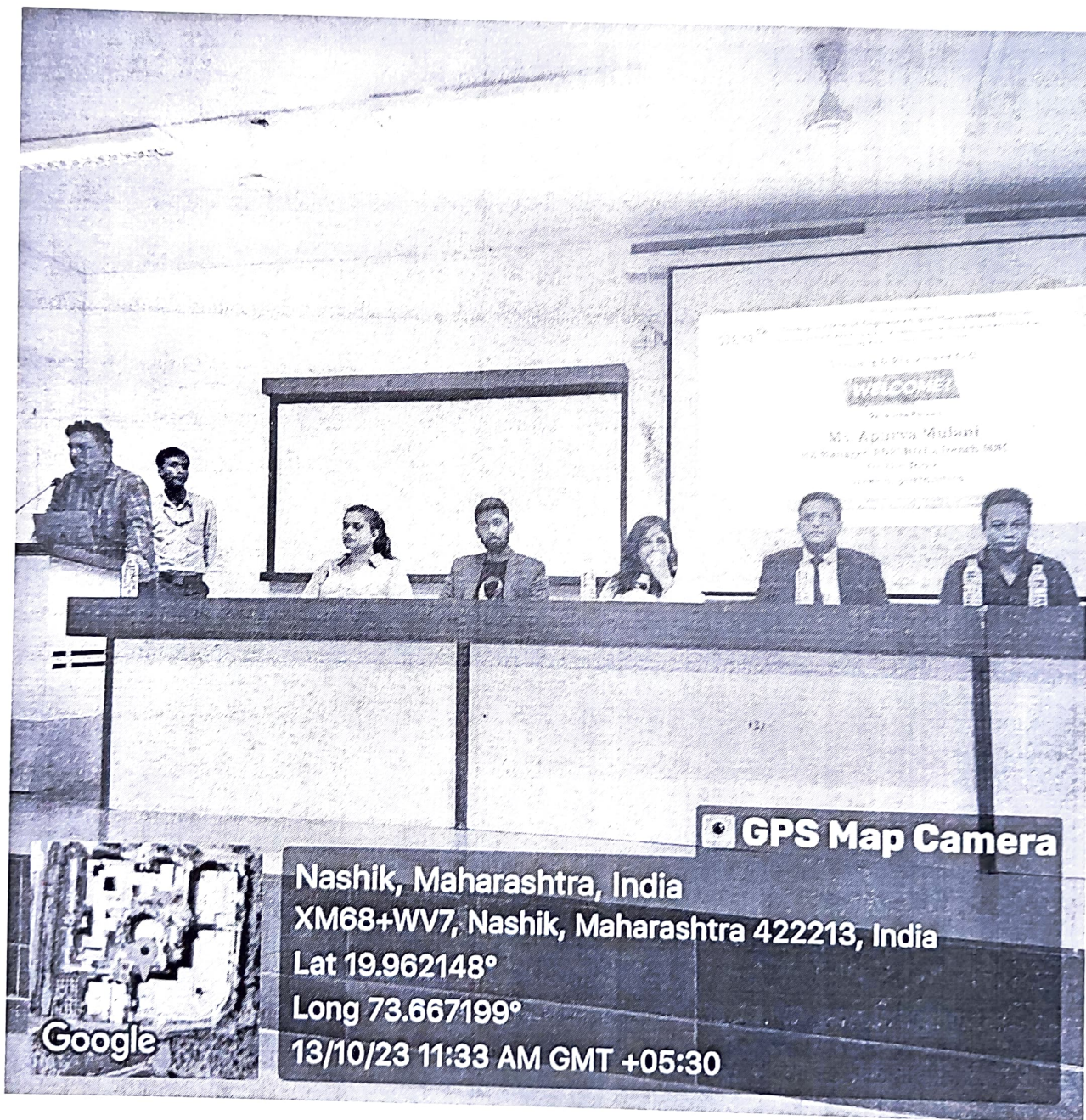
Speaker Guest on Dais