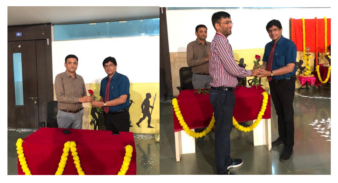
Felicitation of HoD Sir and staff members by Principal Sir

Then the students of civil department arranged nice program with some entertaining game and activities for the staff members. We clicked nice photos beside then sculpture and the program ended.