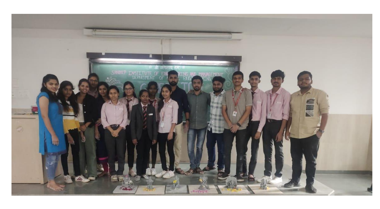
PARTICIPANTS AND ECOFRIENDLY GANESH IDOL