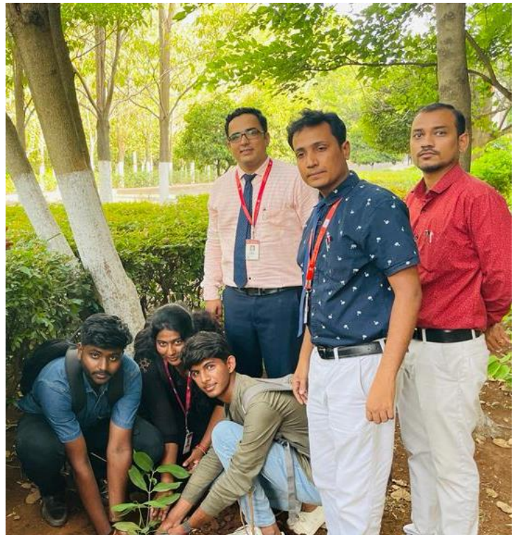
Tree Plantation by IEE members & Students