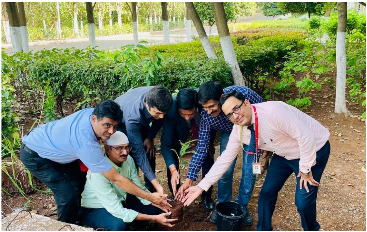
Tree Plantation by all the Guest & Principal