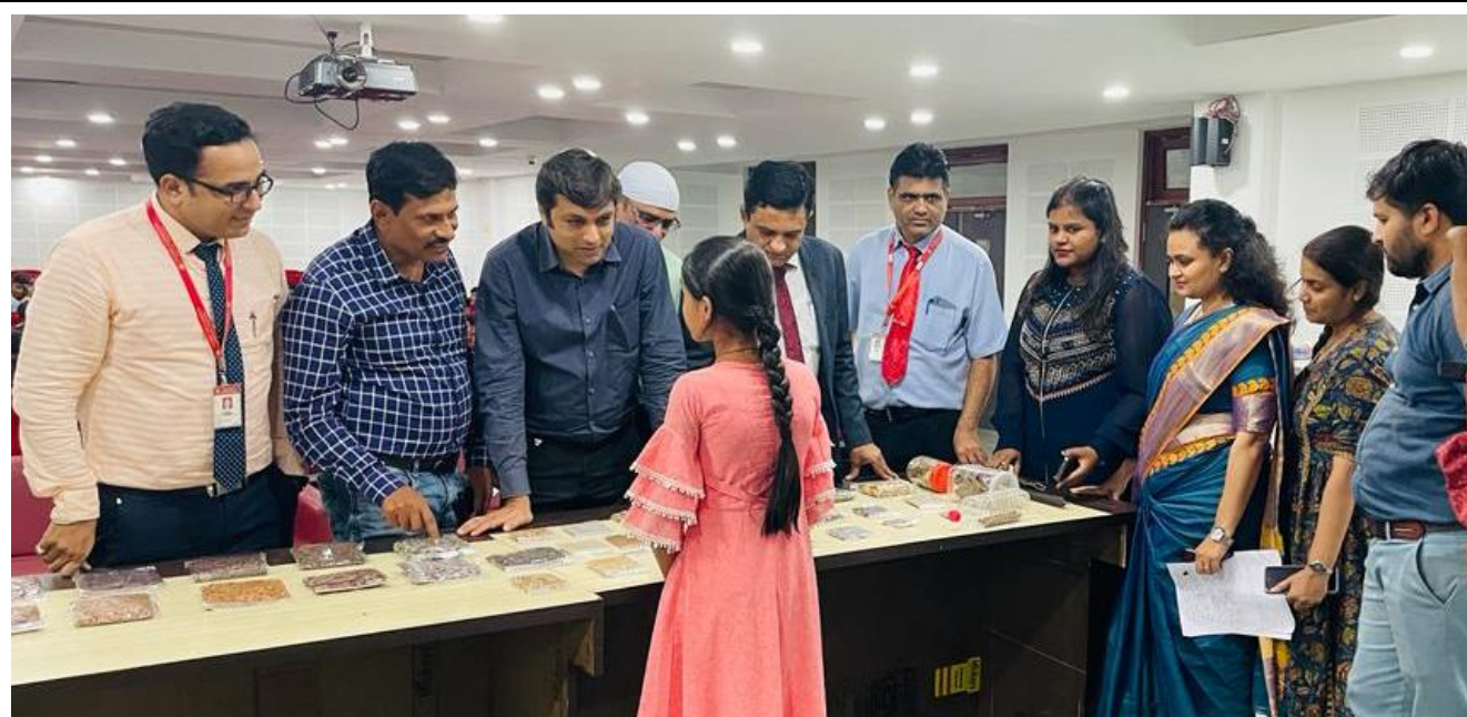
Seed Identification Activity