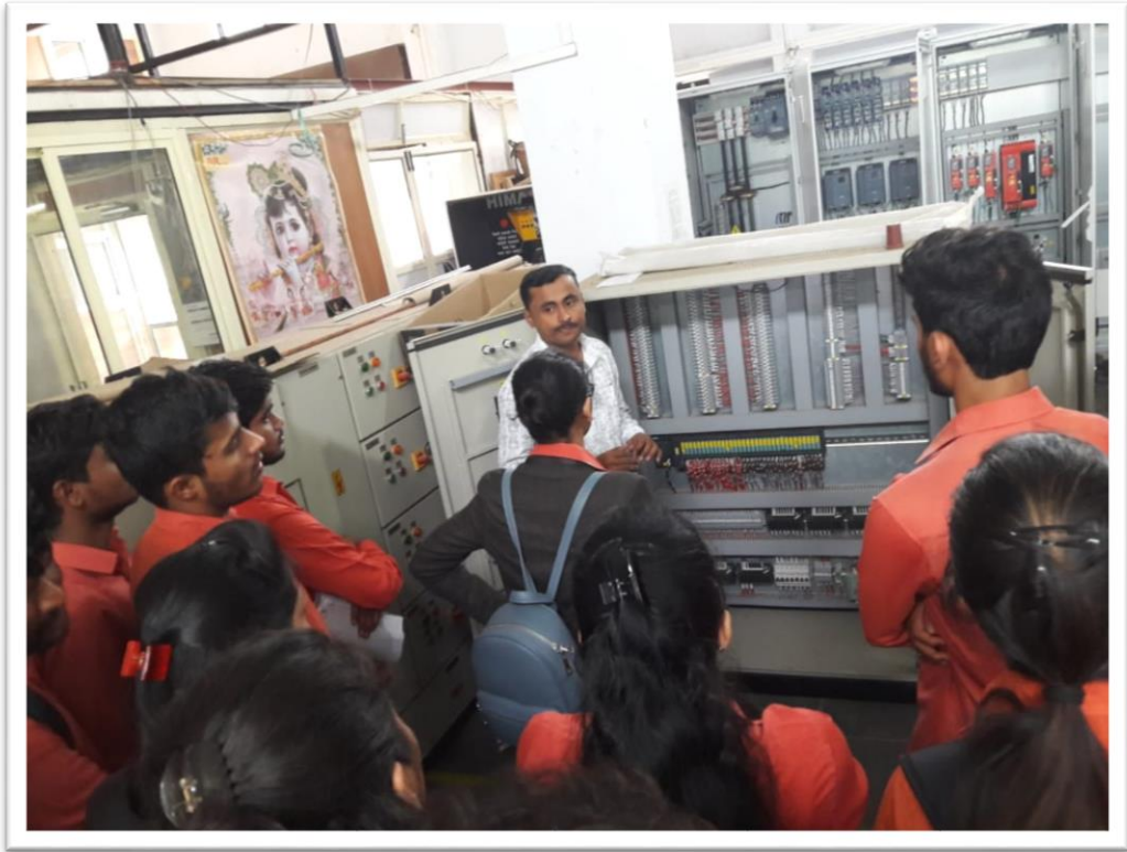
PLC System View