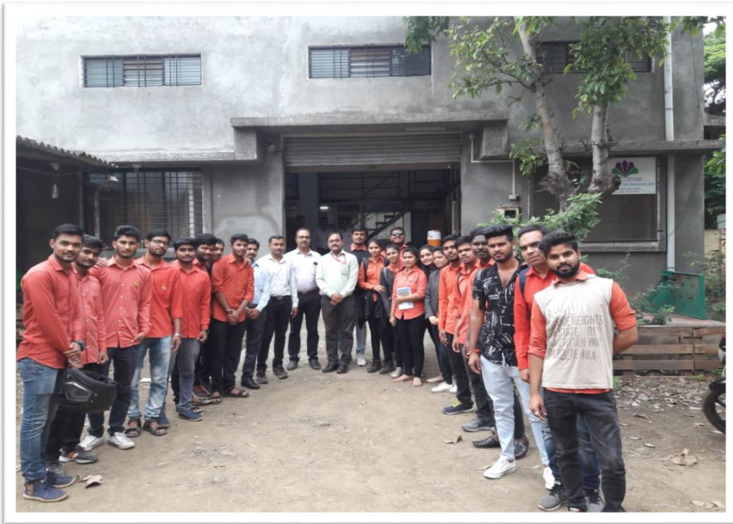
Group of B.E. Students at Entrance of Visionary Technologies