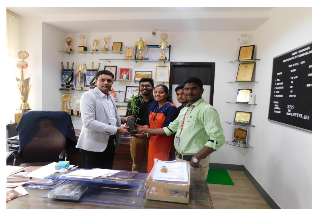
Started the Green Initiative with Hon. Principal Sir