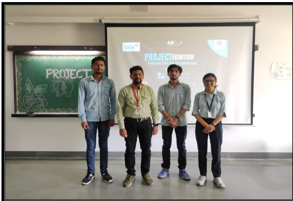
Runner-Up – VR-Education using Metaverse