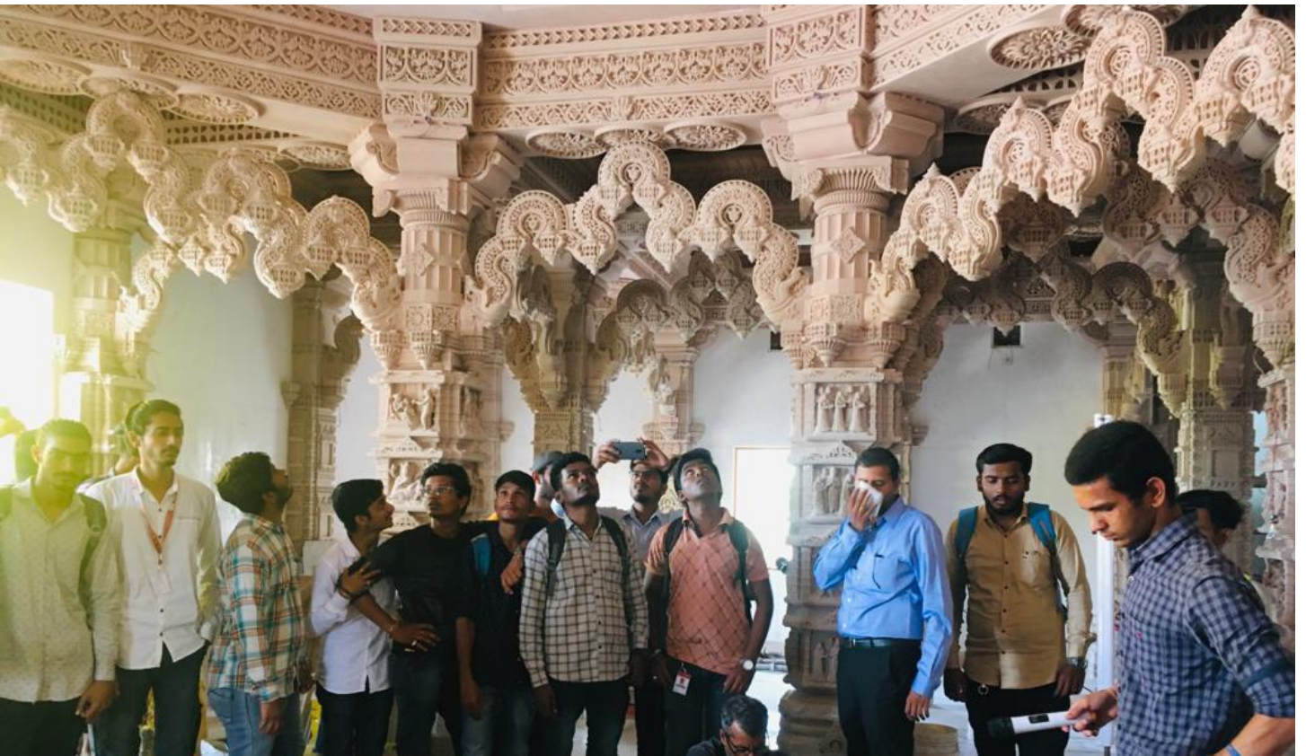
Inside the temple