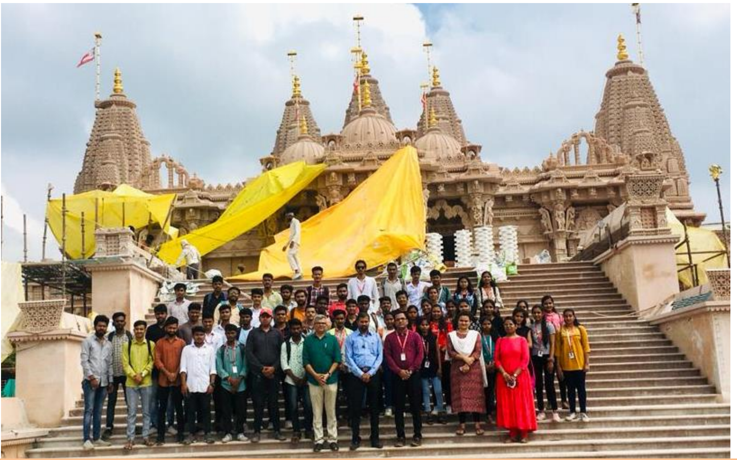
Group Photo at Temple Entrance.