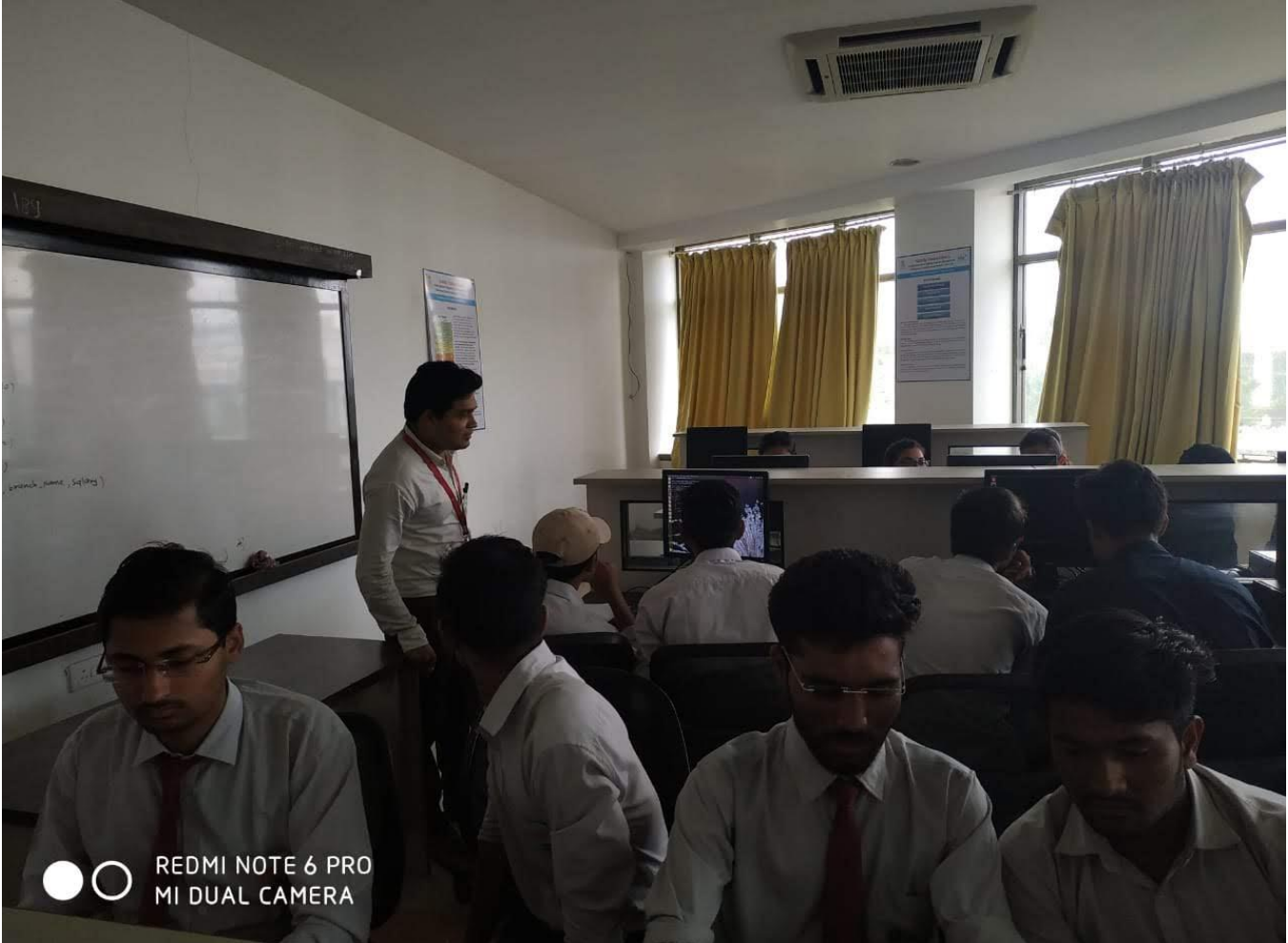
● ○ REDMI NOTE 6 PRO MI DUAL CAMERA